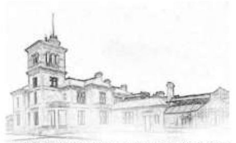
FRIENDS OF SEAFIELD HOUSE